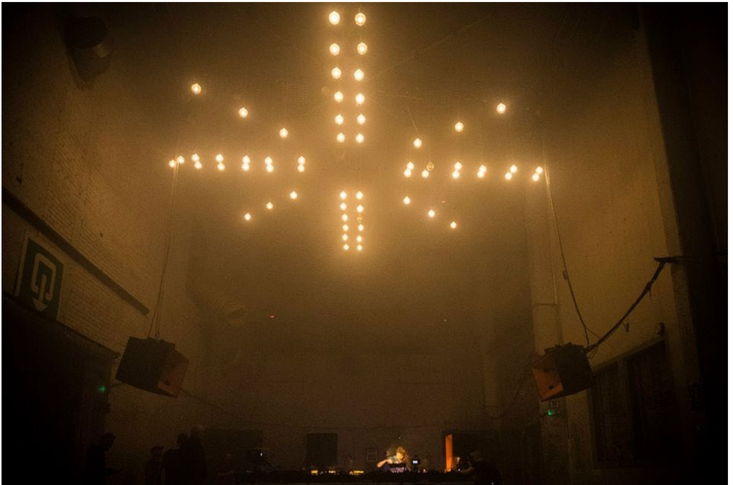
Charlotte de Witte plays at Kompass Klub during Lockdown Sessions.

The unmanned cameras were all plugged in to BirdDog Studio via HDMI including one that was on a GVM 48" slider behind the DJ's on continuous loop, and a camera with a fisheye lens in front of the DJ to act as the hero shot.