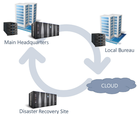
Multi-tier, Multi-Site Management